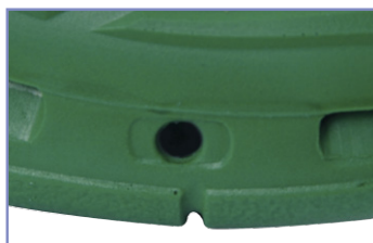
Simple fastening of the orthopaedic insole via a click system.