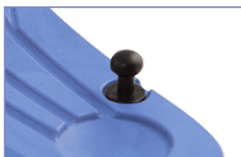
3-point fastening for a secure fit.