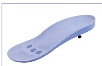
Orthopaedic insole supports your posture.